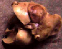
High Calorie w/Resveratrol Group